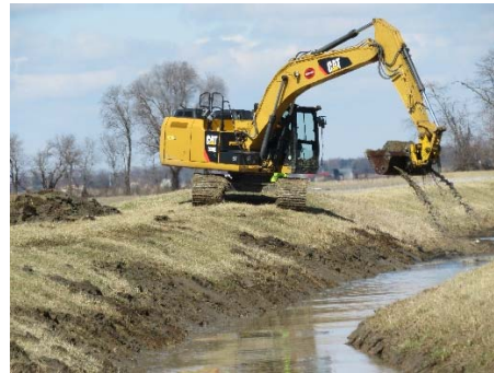
PCE crews cleaning Greenbriar Ditch