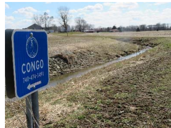
Congo Ditch cleaned back to grade.