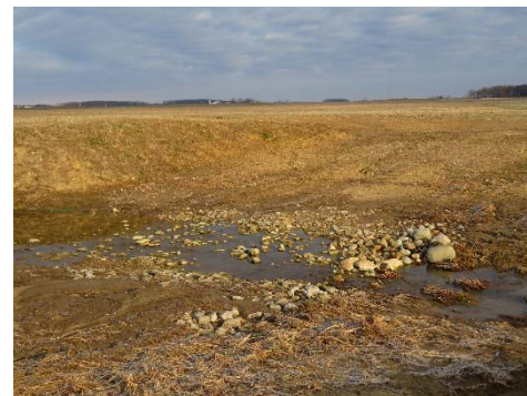
Low-Level Crossing on Metzger\Ewing\Johnson