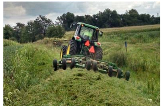
Mowing on Metzger\Ewing\Johnson